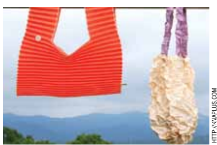
Fun accessories made from bioplastics

But lactic acid cannot be directly polymerized into PLA because the chemical reaction that bonds two molecules of lactic acid together also generates water. The water molecules prevent the growing chain of lactic acid molecules from staying together. So, instead of a long chain of lactic acid molecules, many small chains are formed. They are called polylactic acid oligomers (Fig. 2b)—in which "oligomer" means "small chain."