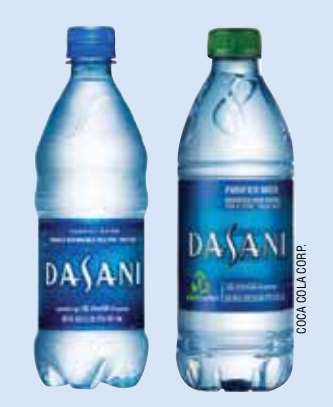
Can you tell the difference? The bottle on the left is made with polyethylene, the one on the right with 30% plant material. The bottle on the right is better for the environment, so why not use it?

(a) poly-3-hydroxyvalerate; (b) poly-4hydroxybutyrate ( n is a large number.)